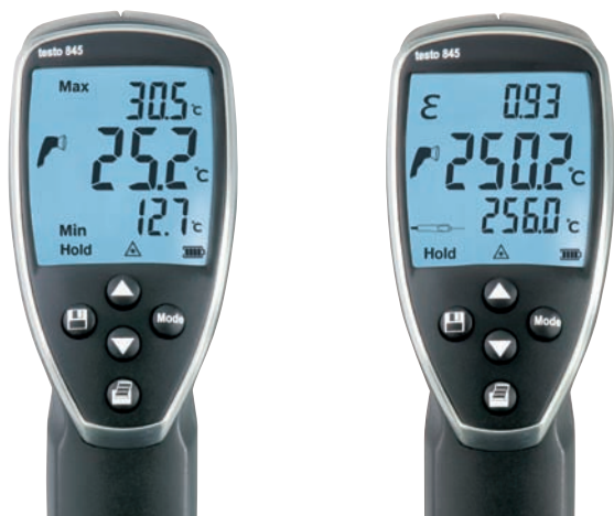
Display view infrared measurement: current value, min./max.value