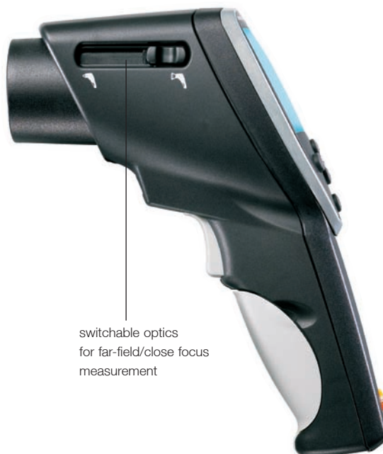
switchable optics for far-field/close focus measurement